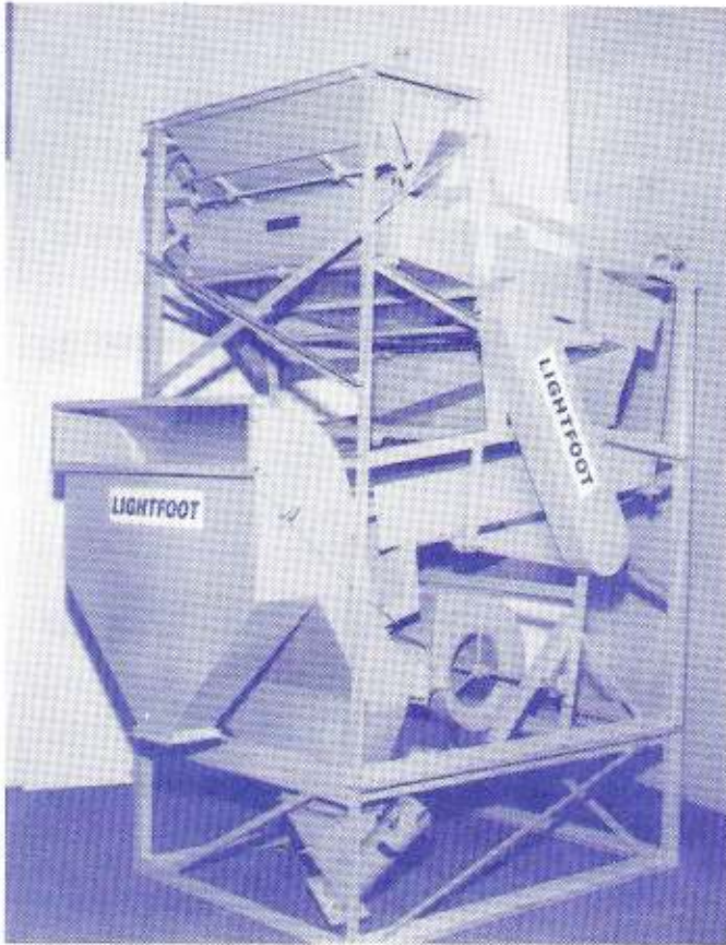
MODEL 6048 4 SCREEN